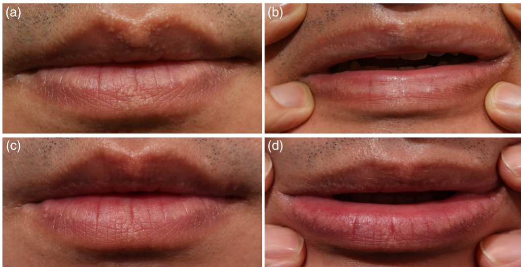
FIGURE 1 (a) Multiple flesh-colored papules on the lips, before treatment. (b) The lips are laterally stretched to enhance accuracy. (c,d) The size and number of granules are markedly decreased 3 months after treatment